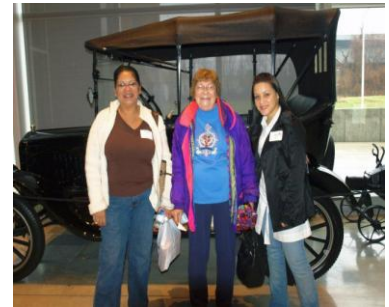
Staff members in group photo.