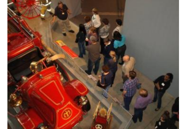
Staff Day 2009 held at America on Wheels.