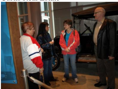
Staff members chat about the museum.